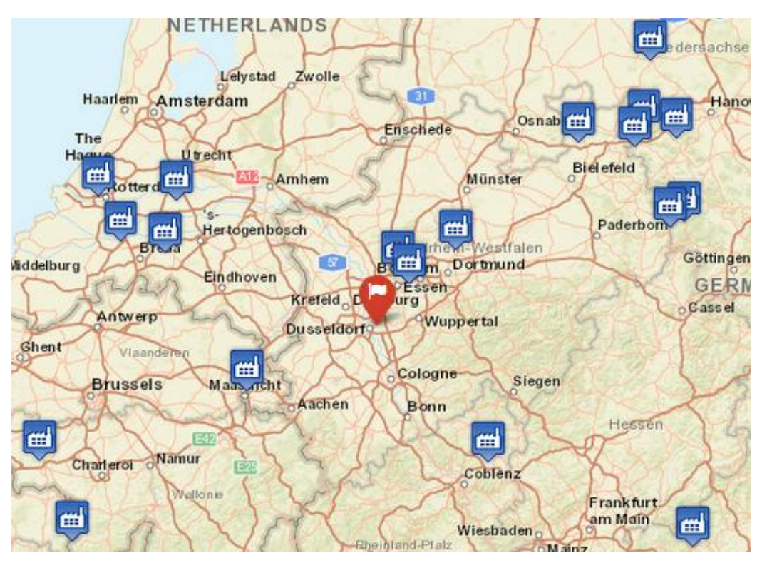
Picture 2: Map with symbols for your own location and glass factories in a selected distance

The study shows the glass plants of your target group as a table or in a map - ideal for the evaluation of an itinerary at a glance.