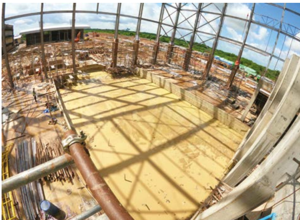
Myanmar Golden Eagle (MGE) Co Ltd is managed jointly by the Osotspa/Siam Glass team and their local partners in Myanmar.