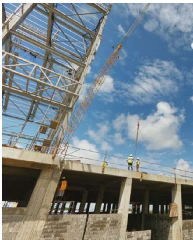
When completed, the first phase of the glassworks will produce 300 tonnes/day of glass packaging.

Forming equipment has been sourced from sister companies Bottero and Revimac, while fellow Italian enterprise Antonini is responsible for delivering the annealing lehrs. At the cold end, ▶