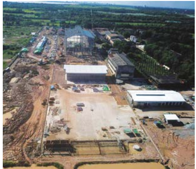
The Myanmar Golden Eagle Co Ltd site at Yanking Township, Yangon.

Thailand and internationally, implementing targeted approaches to ensure their popularity by reflecting consumption behaviour and meeting constantly changing consumer needs. Its main international markets are neighbouring Myanmar, Cambodia and Laos, followed by Indonesia and Vietnam. In addition, distributors are located in 25 different countries worldwide, including a strong presence in Asia, Africa, Eastern Europe, North and South America.