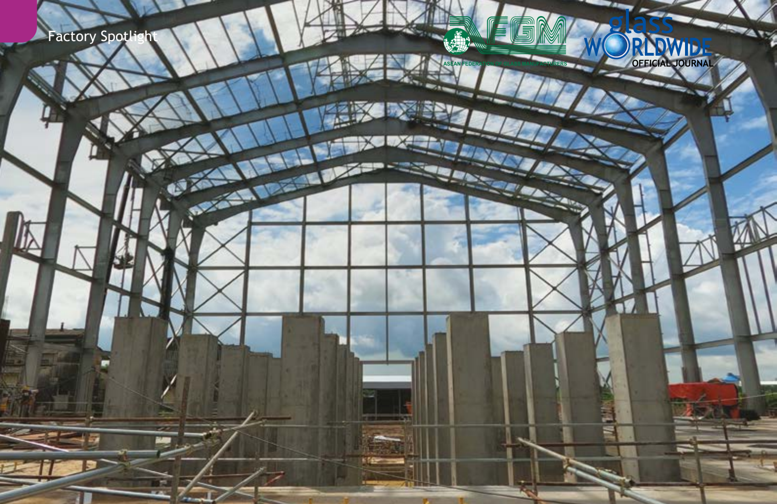
Construction work at the Myanmar Golden Eagle glass container plant is scheduled for completion by the end of 2020.