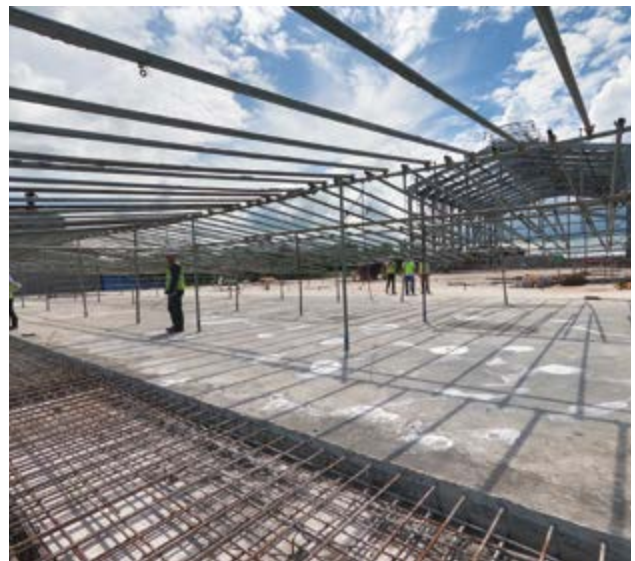
Construction work at the Yangon site has been largely unaffected by the global Covid-19 pandemic.